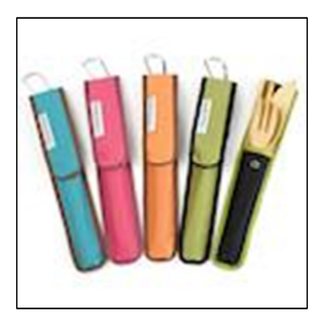
Figure 2: Bamboo Cutlery Product

Social impacts that the products might have on students and consumers at UBC who use this product were also considered. It is expected that students will find the set to be visually appealing and unique as the sets come in a variety (9) different colours. In terms of portability, the set comes with a carabineer that enables the case to be clipped to any backpack or bag.