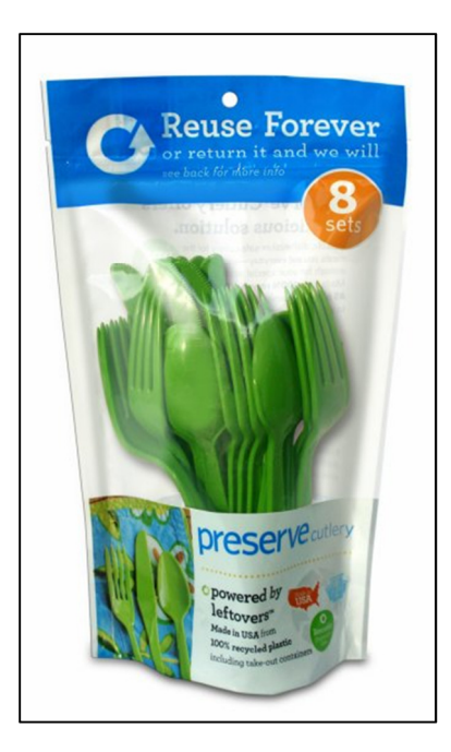
Figure 3: Polypropylene Plastic Cutlery Product